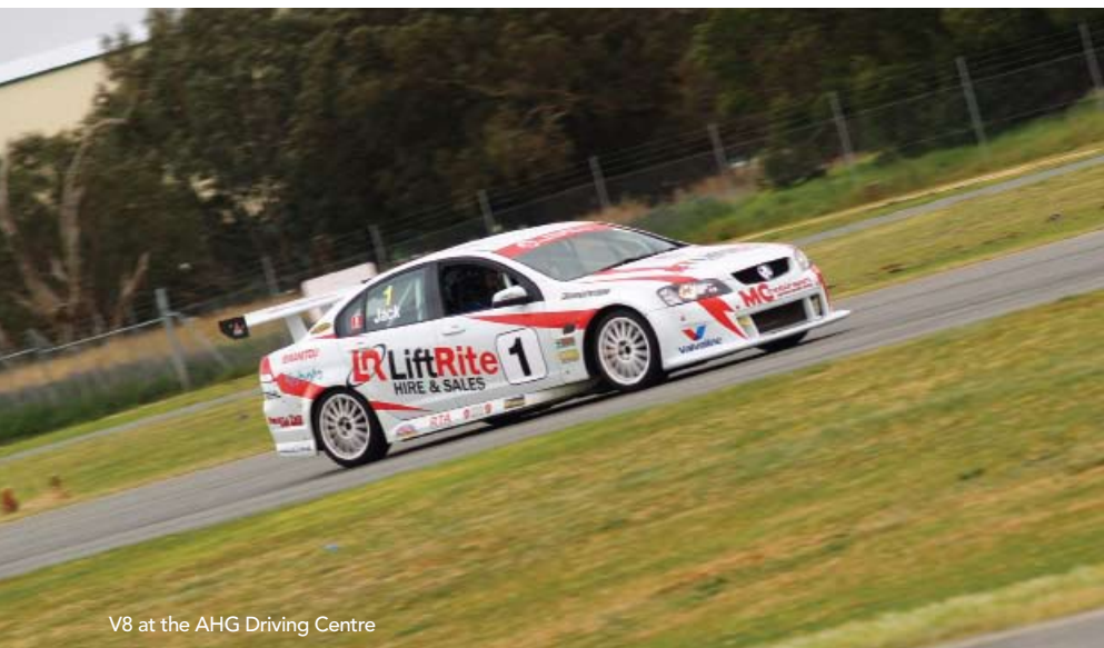
V8 at the AHG Driving Centre